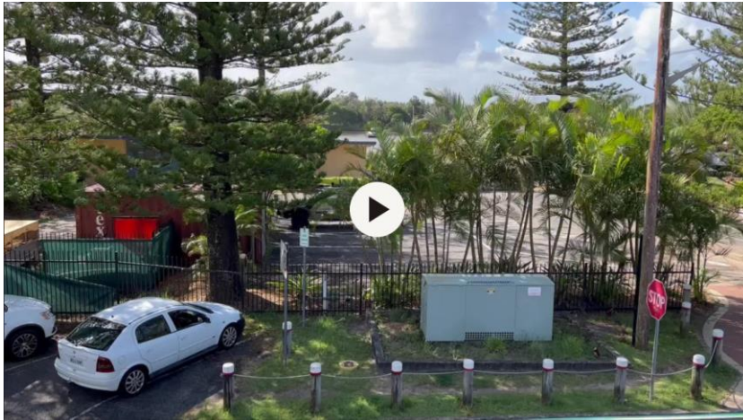
North view from lower level Apartment - 1 Yamba Street Yamba