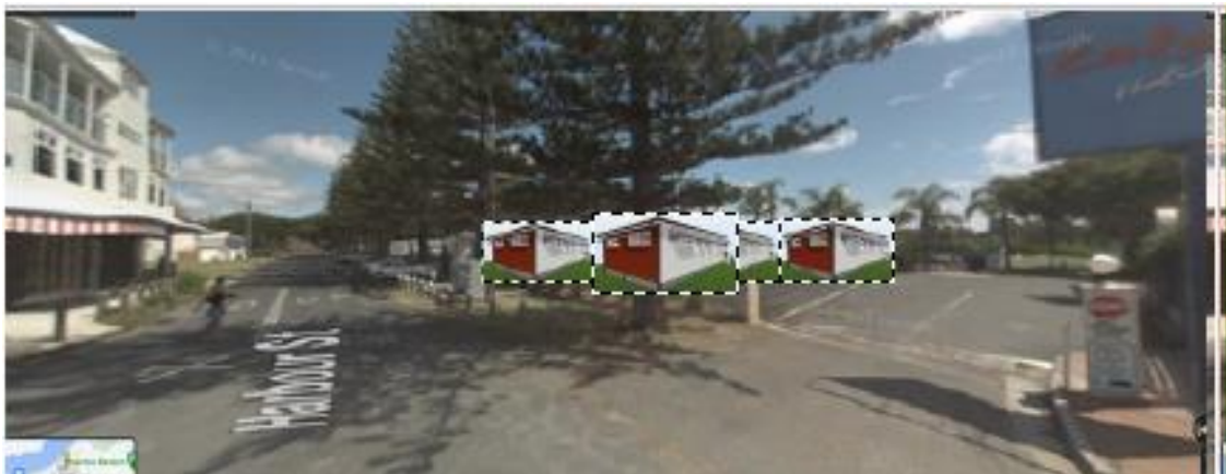
Photomontage of cabins at street level Harbour Street

The street view shows that sight lines from the unit building windows to the river will be only slightly impeded if at all by the cabins.