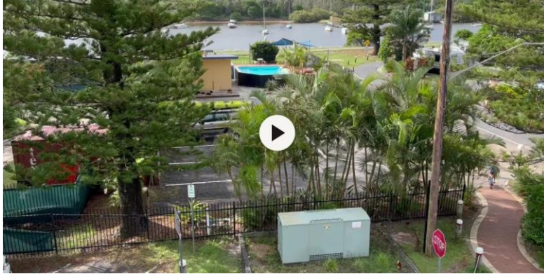
North view from upper level Apartment - 1 Yamba Street Yamba