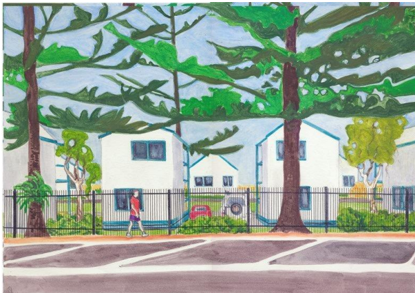
Original concept plan from consultation of redevelopment of caravan park