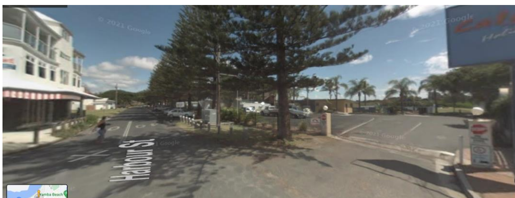
Street view 1 Yamba Street and Calypso Caravan Park entrance